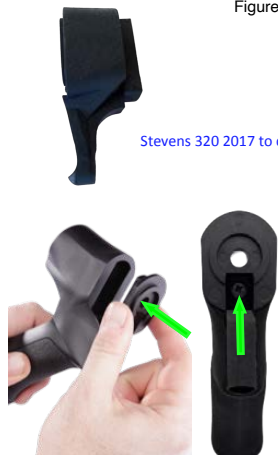
Stevens 320 2017 to current

Place the appropriate adapter from above into the pistol grip as seen in (Figure 3a) (We are using the Mossberg adapter as an example.) Press the adapter into place. Now screw the adapter in place using the (#13) 6-48 x 1/2" Plastite Phillips Flat Head Screw.