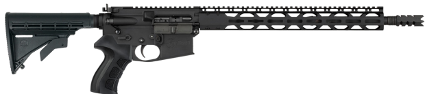
A. AR-15/10 Classic Stock