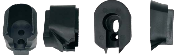
Remington 870/7400 12ga

Slide the backstrap off of the pistol grip as seen in (Figure 2).