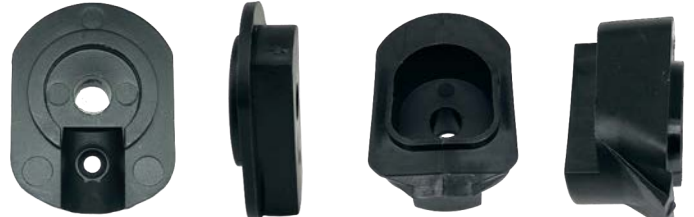
Mossberg 500/535/590/835 12ga & 20ga (proud fit) Maverick 88 12ga & 20ga (proud fit)