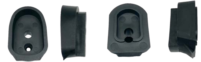
Remington 887 12ga