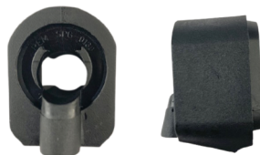
Remington 870 12GA