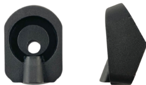
Winchester 1200/1300 12ga